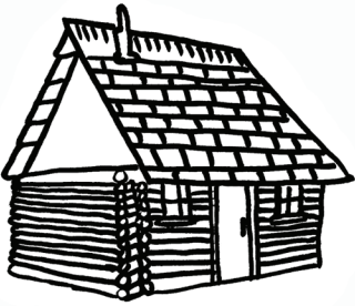
Fur warehouse at Summit Lake