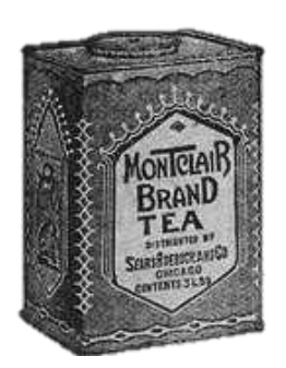
Tea - $0.40/lb.