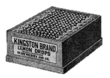
Candy - $0.45/box