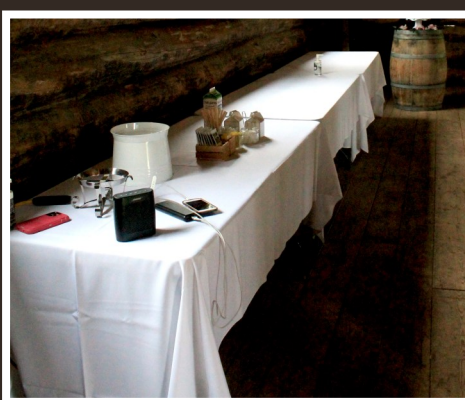
Extra table(s) with linen