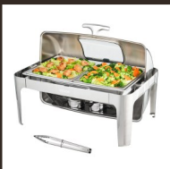
Roll top chafing dish