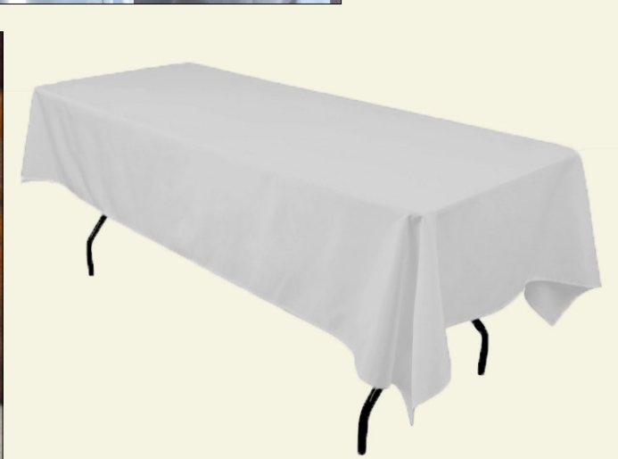
Table with linen