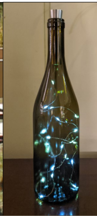
Wine bottle lights