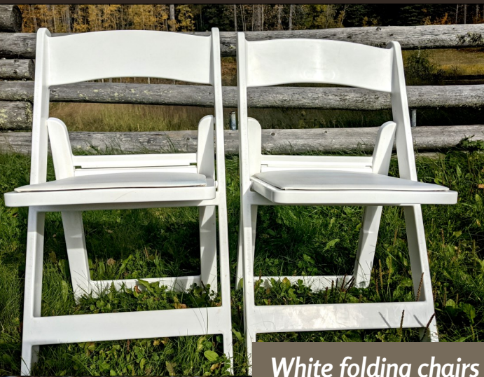
White folding chairs

Rental parties may choose their desired seating option.