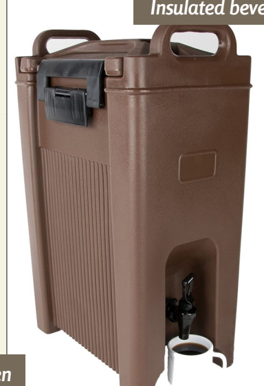
Insulated beverage dispenser