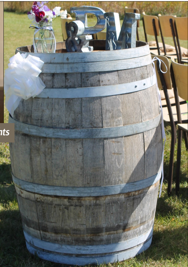
Barrels (2 for display)