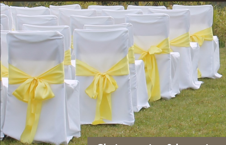
Chair covering & bow tying

R emember, your rental is completely customizable