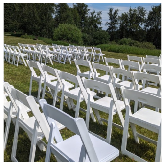
White folding chairs

Rental parties may choose their desired seating option