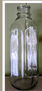
Milk bottles (10)