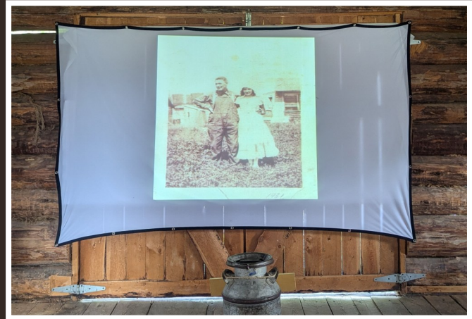
Projector and screen (laptop included)

Remember, your rental is completely customizable!