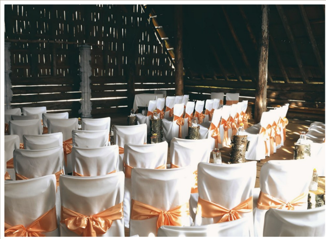
Chair covering and sash tying - limited chairs available