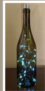
Wine bottle lights (6)