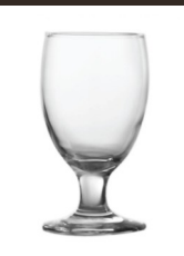
Water goblets (10)