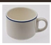
Stacking mugs (10)