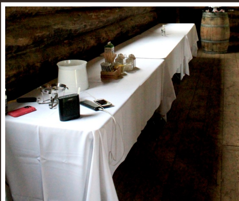
Extra table(s) with linen