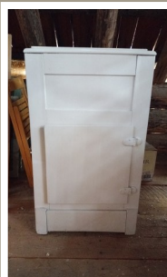
Ice box, ice included