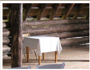
Signing table and chair