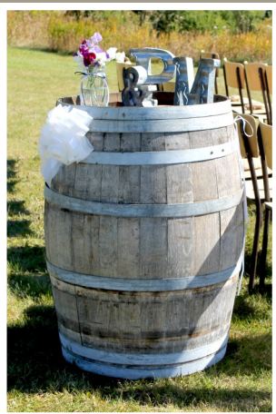
Barrels (2) for display (Weathered or new)