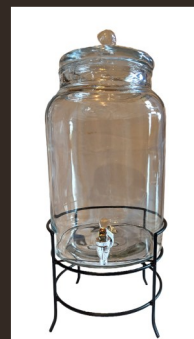
Beverage crock with spigot (water included)