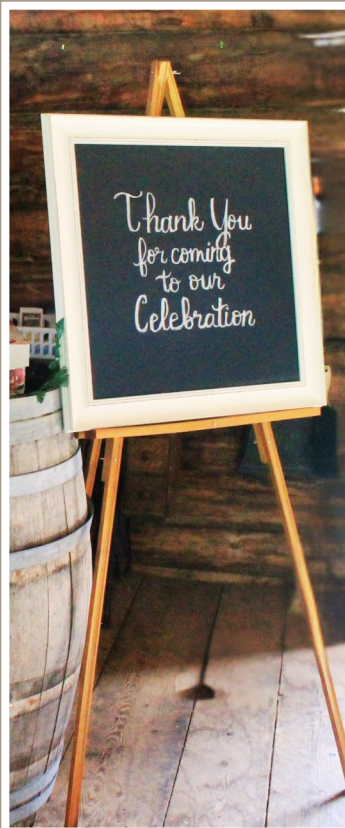
Chalkboard and easel