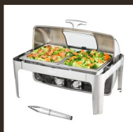
Roll top chafing dish