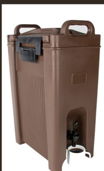
Insulated beverage dispenser