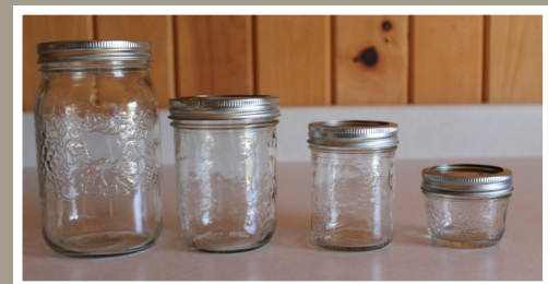
Mason jars & flameless tea lights (10)