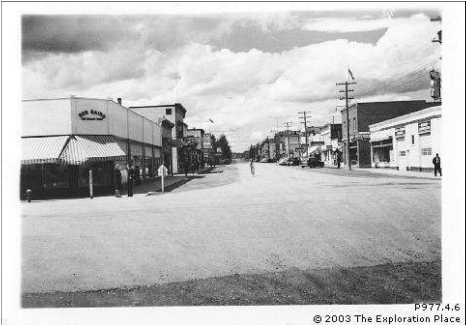
Third Avenue & George Street Circa 1945