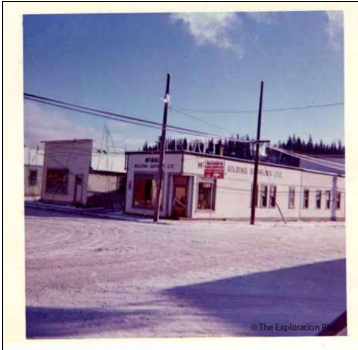
McInnis Building Supplies (February 1962), now McInnis Lighting