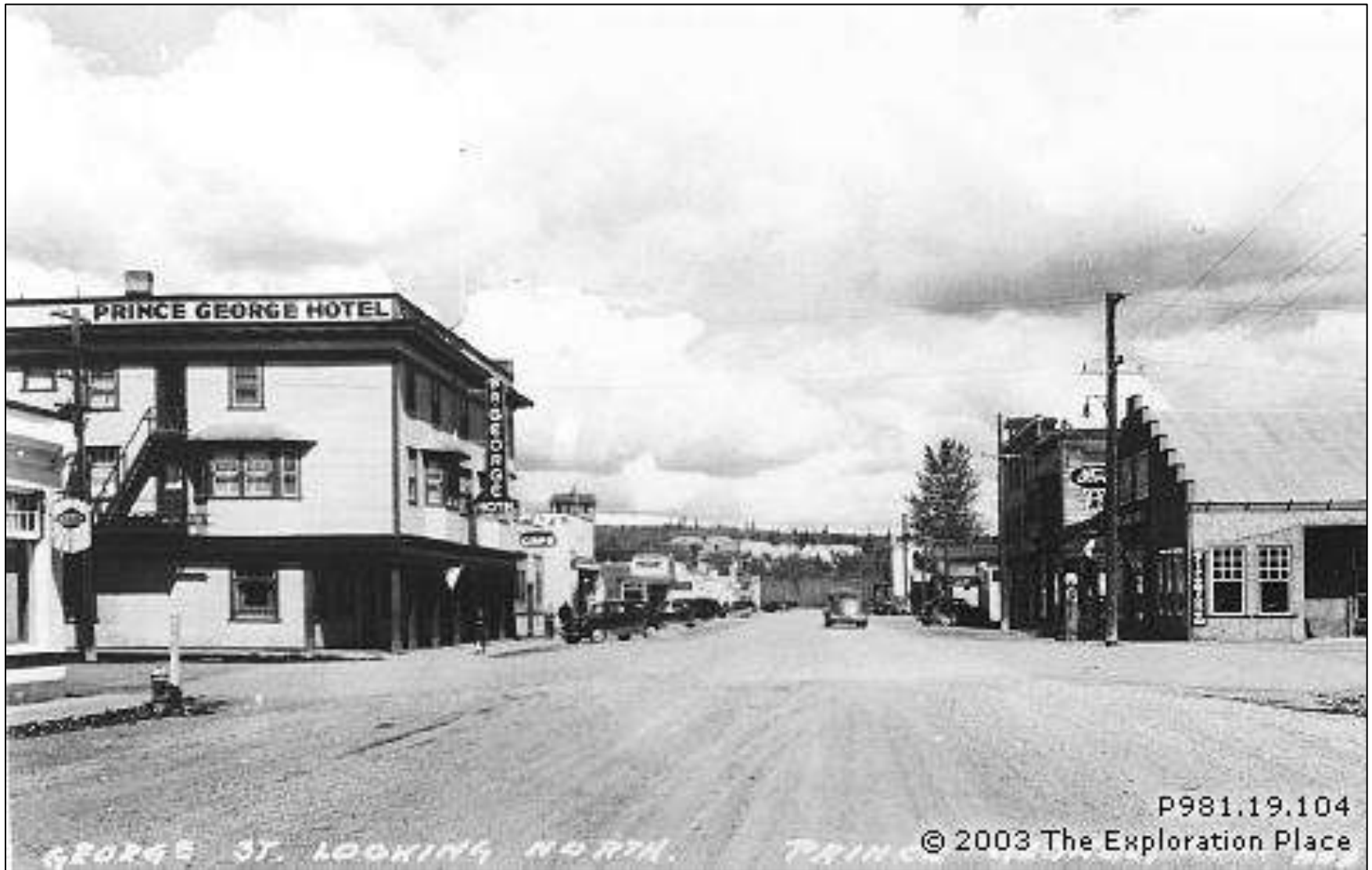
George Street & 5 th Avenue Circa 1940s