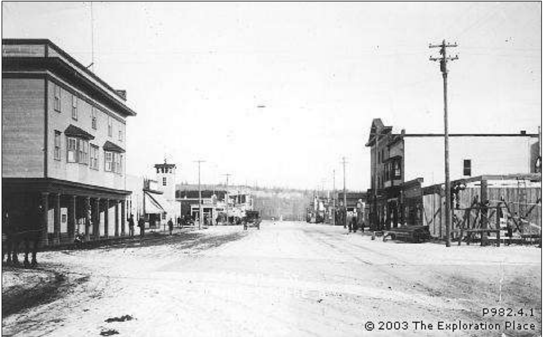
George Street & 5 th Avenue 1930