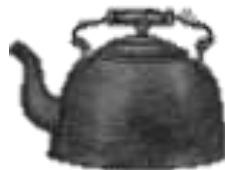
Kettle - $0.70