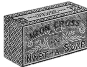
Soap - $0.05/bar