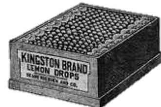
Candy - $0.45/box