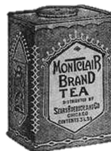
Tea - $0.40/lb.