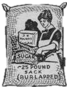
Sugar - $0.25/5lbs.