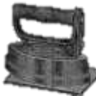
Iron - $0.50