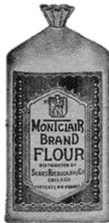
Flour - $0.15/5 lbs.