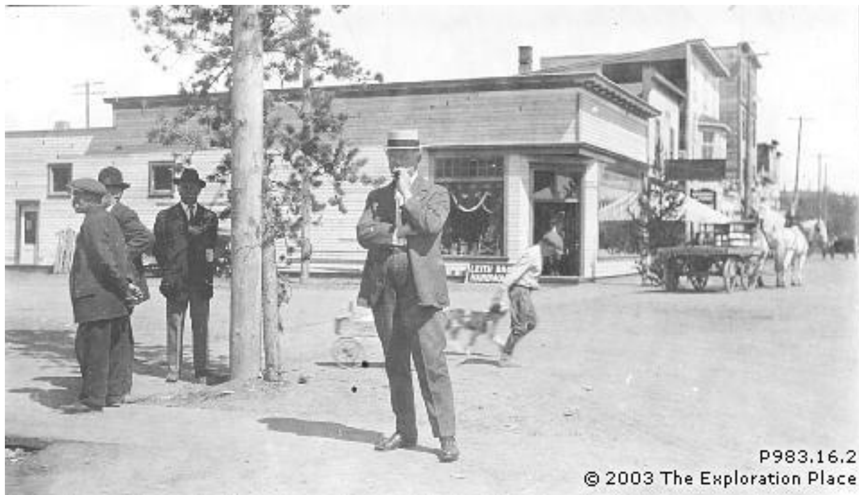
Third Avenue & George Street Circa 1920s