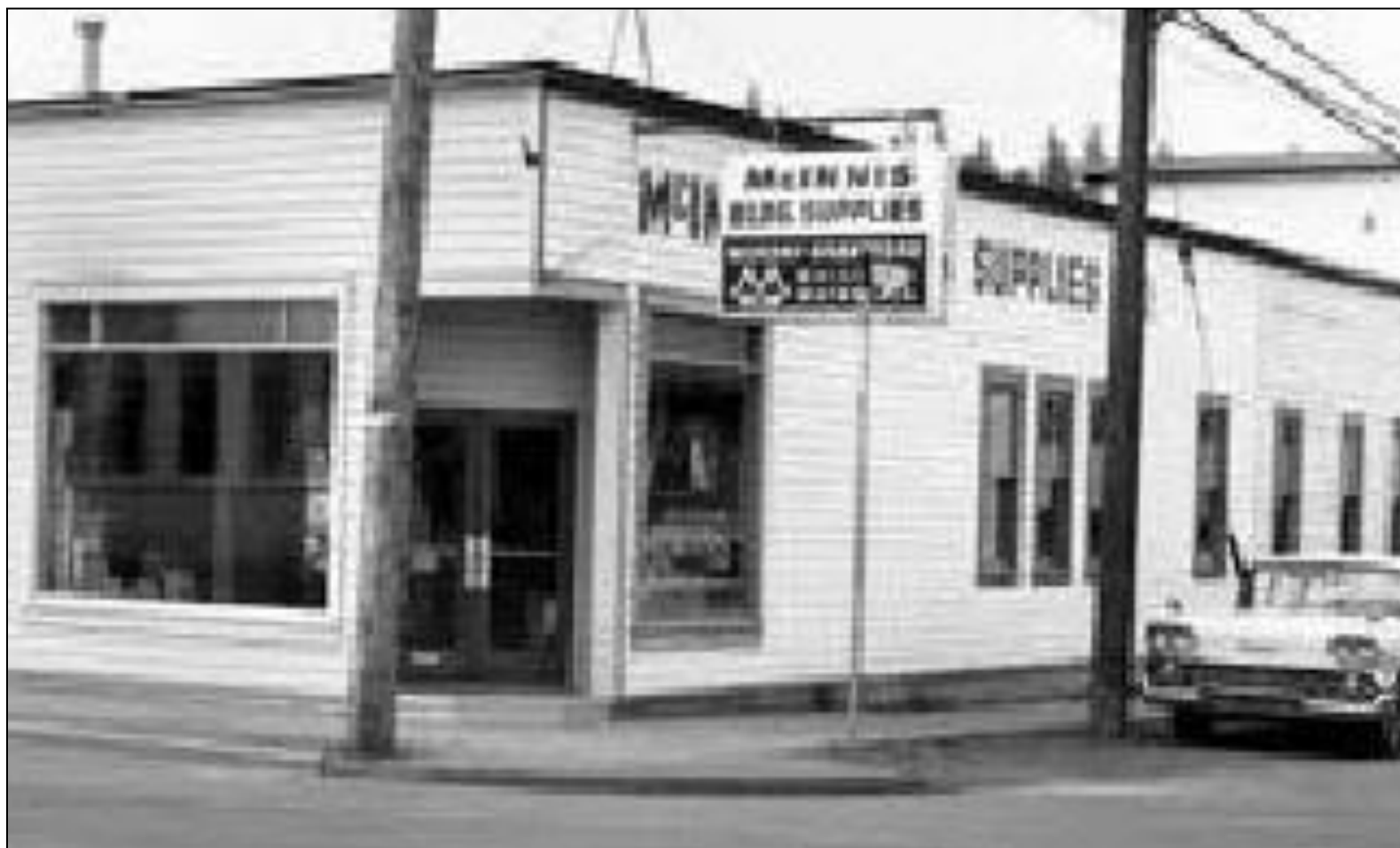
Also: 2011.29.1 2011.29.7 McInnis Building Supplies