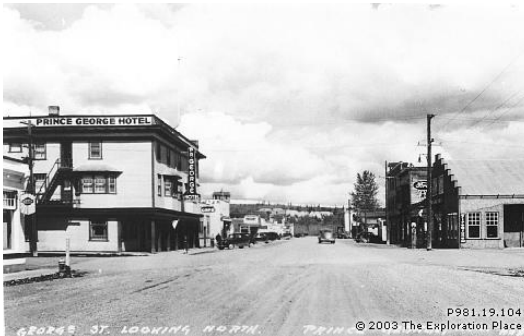
George Street & 5 th Avenue Circa 1940s